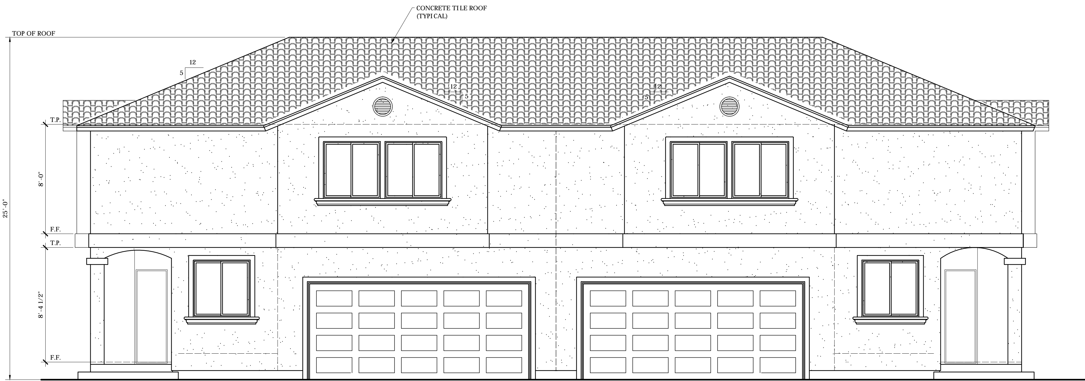
FRONT EXTERIOR ELEVATION (BUILDING # 1,2&3) SCALE 1/4" = 1'-0"