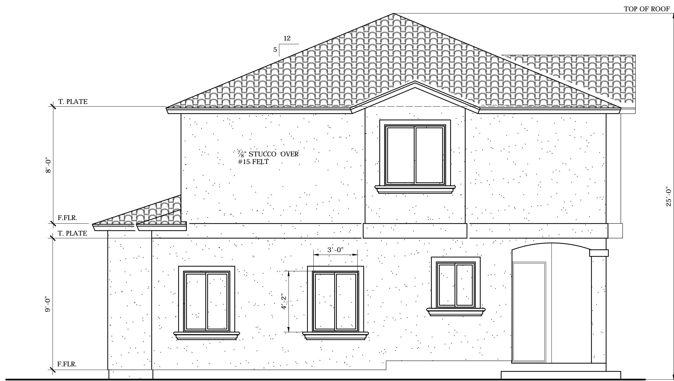
LEFT SIDE EXTERIOR ELEVATION (BUILDING 1,2&3) SCALE 1/4" = 1'-0"